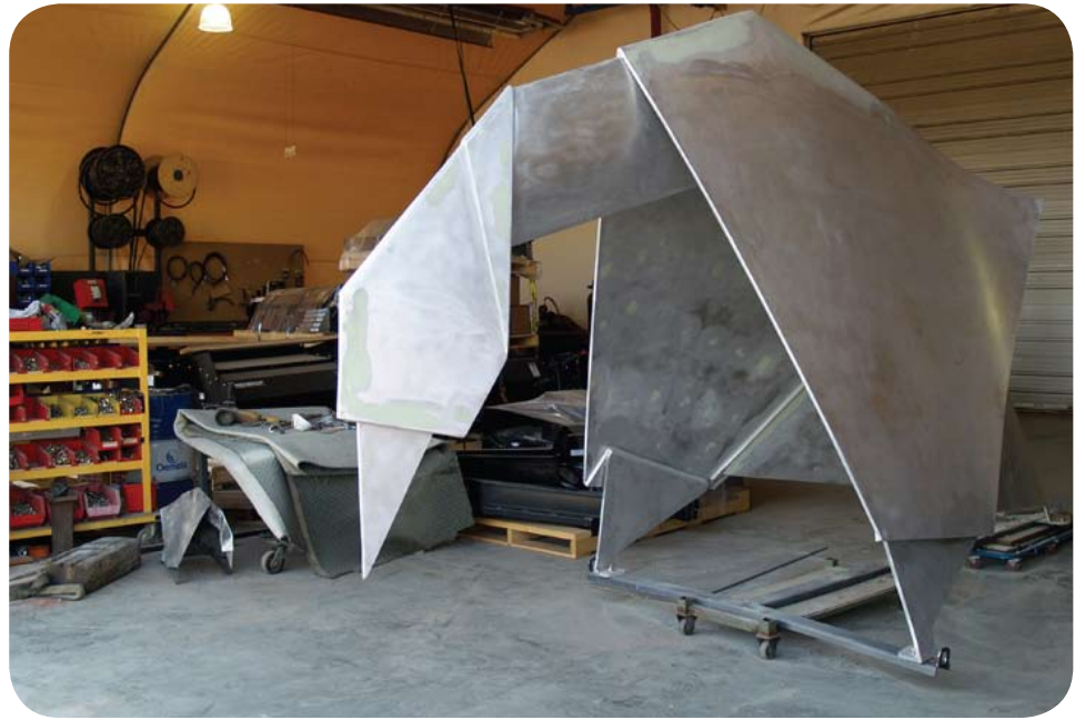
Origami goose under construction