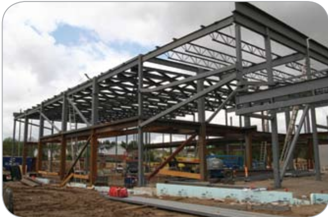
3. May 2010