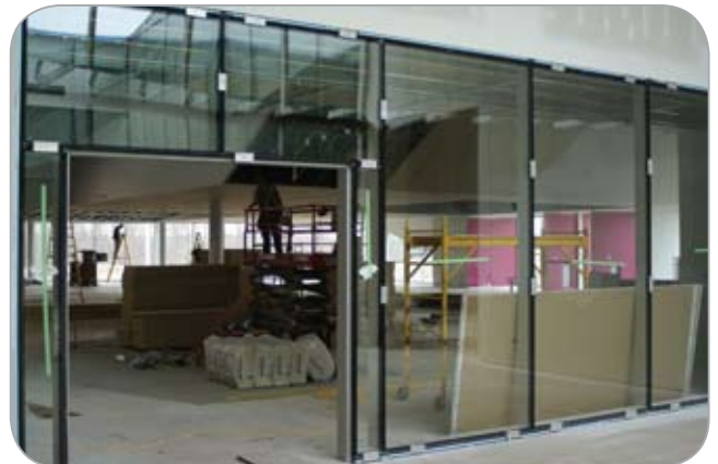
8. May 2011