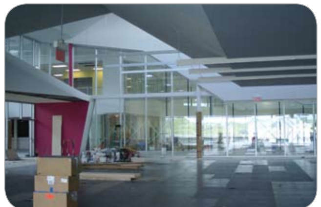
12. July 2011