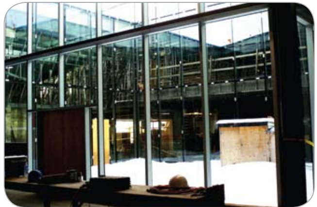
6. January 2011