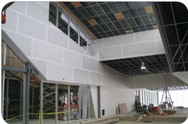
7. March 2011