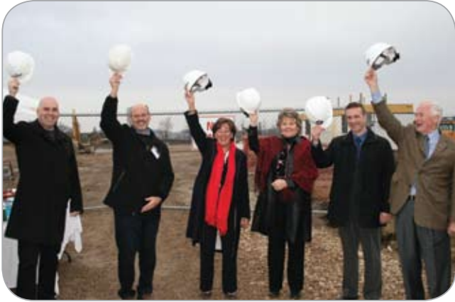
1. November 2009