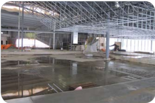
5. September 2010