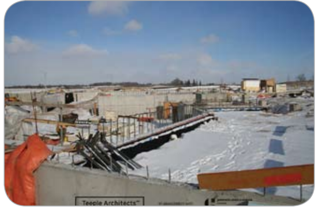
2. January 2010