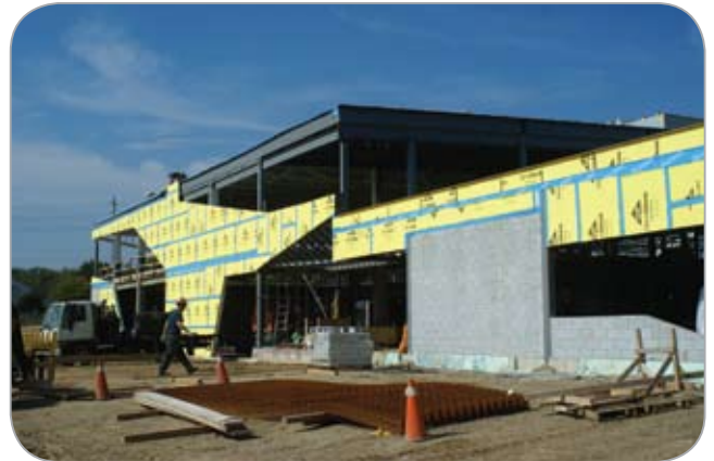
4. September 2010