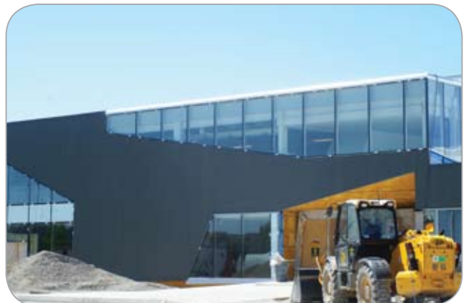
10. June 2011