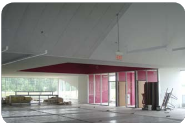
11. July 2011